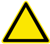
Hazard Alerting Safety Symbol

Your power tool and its Owners Manual may contain "WARNING ICONS" (a picture symbol intended to alert you to, and/or instruct you how to avoid, a potentially hazardous condition). Understanding and heeding these symbols will help you operate your tool better and safer. Shown below are some of the symbols you may see.