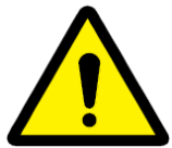
Safety alert symbol is a symbol that indicates a hazard.