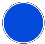
Mandatory Action Safety Symbol