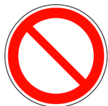
Prohibition Safety Symbol